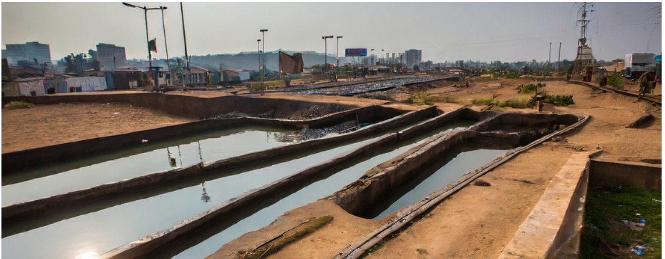
Sewer networks in a Sub-Saharan African city. Image generated on Adobe Firefly

Compared to the four Indian cities, other case study cities tend to prioritize SS over NSS due to different underlying institutional structures. Utility sanitation priorities are defined by the KPIs set by or agreed with national level authorities, which traditionally measure SS performance almost exclusively. While recent regulatory reforms have pushed for the inclusion of NSS KPIs and targets in Zambia, the legal and institutional barriers in other countries where the case study cities are located remain paramount. The split in sanitation mandate between SS and NSS service authorities in Kampala and Khulna poses further challenges, given the differences in regulatory and financing structures for utility (SA for SS) and city government (SA for NSS). The vast amount of sanitation financing, especially from government sources, is directed towards SS infrastructure across all four cities in this category.