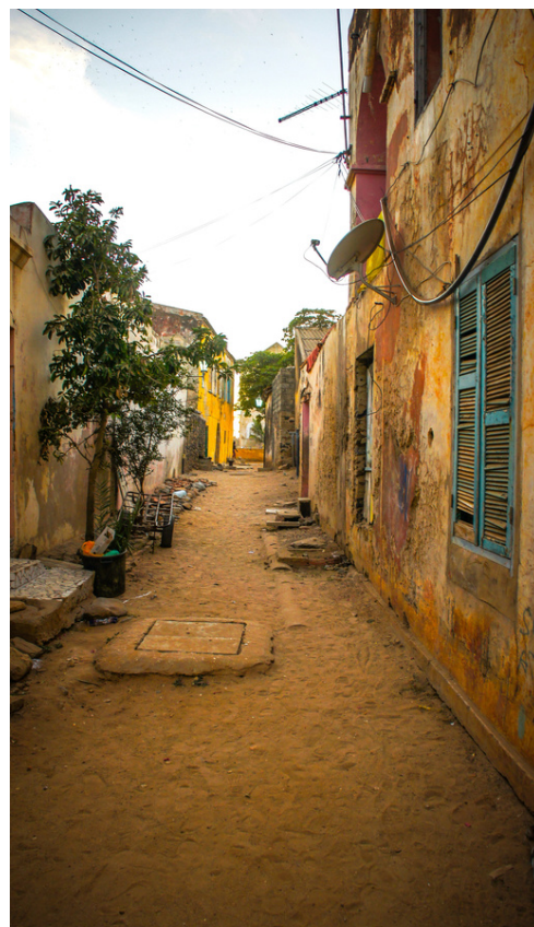
A street on the island of Gorée, off the coast of Dakar, Senegal.

Table 5 summarizes the existence of pro-poor mandate, targets, initiatives and funding sources for the initiatives.