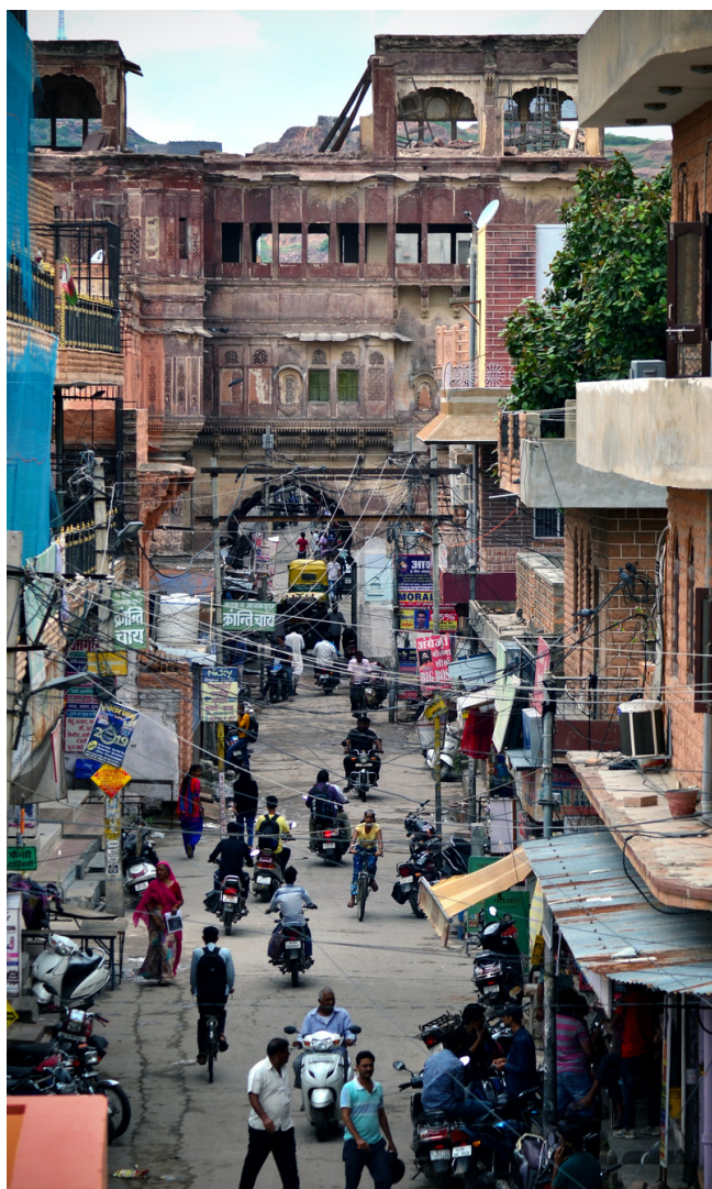
People walking and biking along a busy street in an Indian city.

Through this analysis, the paper seeks to contribute to the discussion of structural issues related to sanitation financing from a perspective of sanitation systems functions. We argue that an inclusive sanitation mandate and an accountability framework with comprehensive performance indicators are critical in driving budget allocation and funding for equitable sanitation interventions that cover the full service chain. The final section of this paper proposes a set of recommendations for national and city level government stakeholders, as well as donors and development financing institutions.