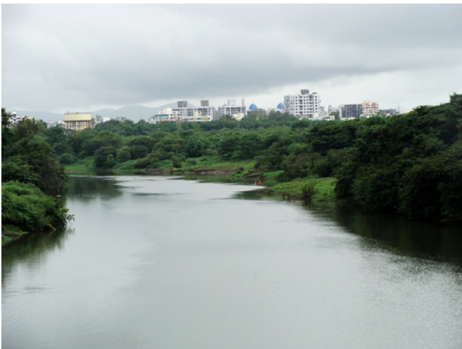
A view of the Mutha River in India.

Based on the understanding of the types of financial resources available to SAs, we look at how the SAs are using the resources available to them.