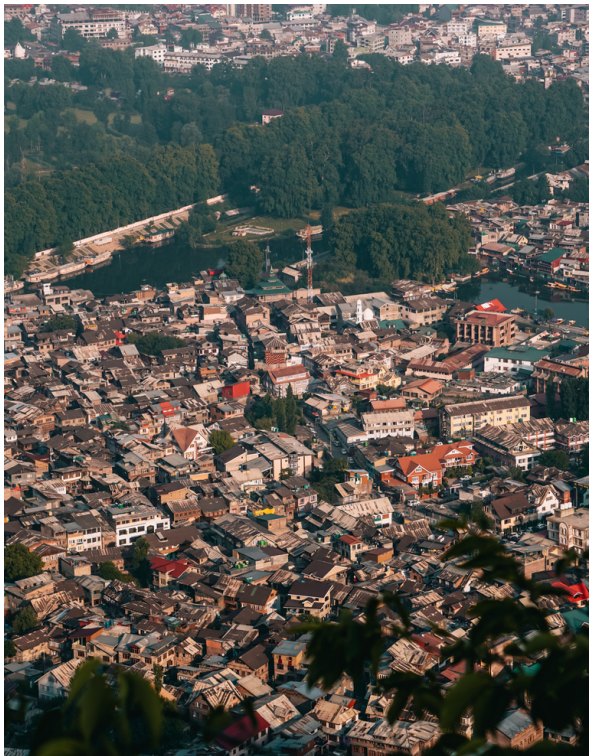
City view in India.

As it is difficult to differentiate the exact sources of financing for a particular service chain segment among these three, tariffs, taxes and fees that form the SA’s own revenue are combined here.