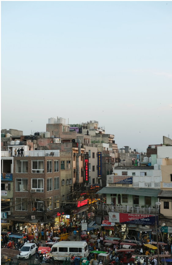
Aerial photo of city buildings in India's capital, New Delhi.

National focus on sanitation infrastructure, especially for sewerage sanitation and toilets, determines that these receive the largest funding flows. Nevertheless, changes are underway in some of the countries of the case study cities to move more towards financing NSS segments beyond toilet access, as will be discussed in the following section.