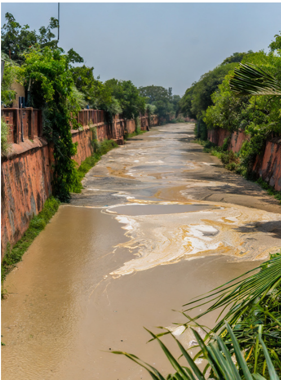
Wastewater effluent and sludge discharge in a river within a city in India.

While sanitation can be broadly used to refer to liquid and solid waste management, this discussion paper uses the term sanitation to strictly refer to the management of human faecal waste, including related wastewater effluent and sludge, and excluding drainage or greywater management.