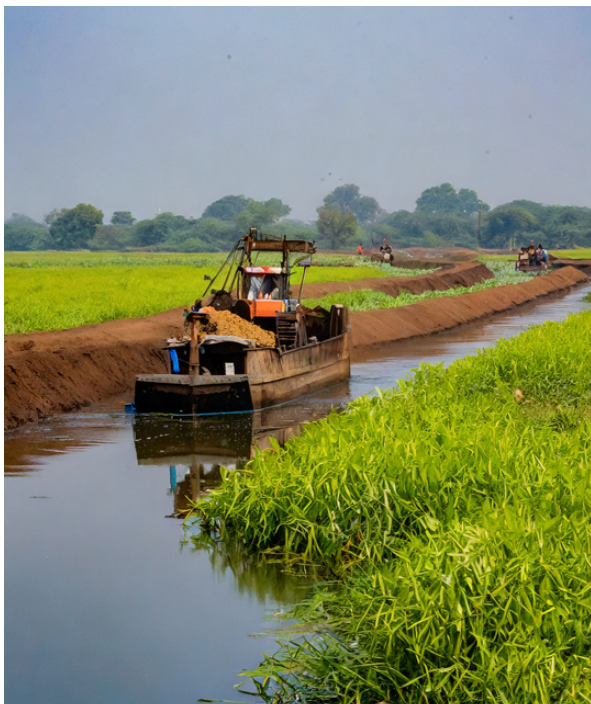
Photo depicting desludging activities in India. Image generated on Adobe Firefly

Several examples from the case study cities, such as Wai's scheduled desludging initiative and Kampala's community-based emptying, have demonstrated tremendous potential of reducing emptying costs, and correspondingly the prices.